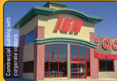
Commercial building with corporate colours