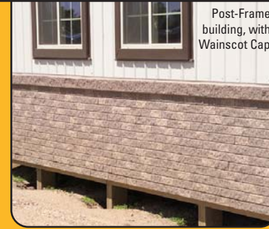
Post-Frame building, with Wainscot Cap