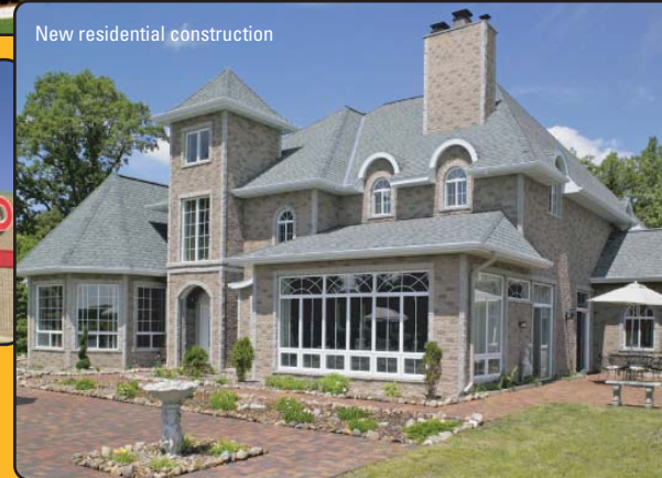
New residential construction

Novabrik requires no brick ledge and can be easily installed on various types of structures and in all weather conditions.