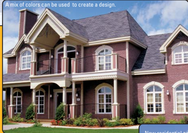
A mix of colors can be used to create a design.