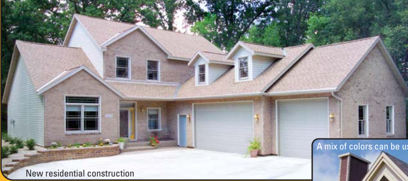
New residential construction