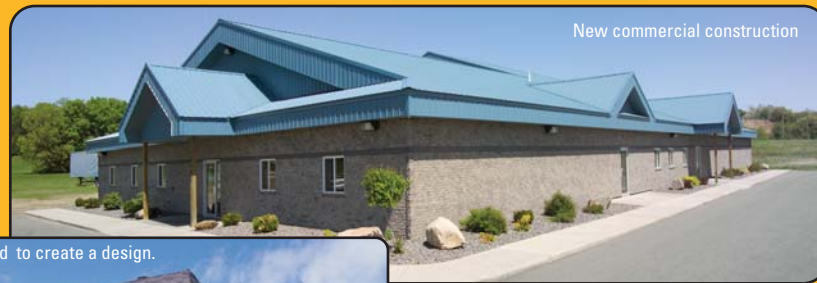
New commercial construction